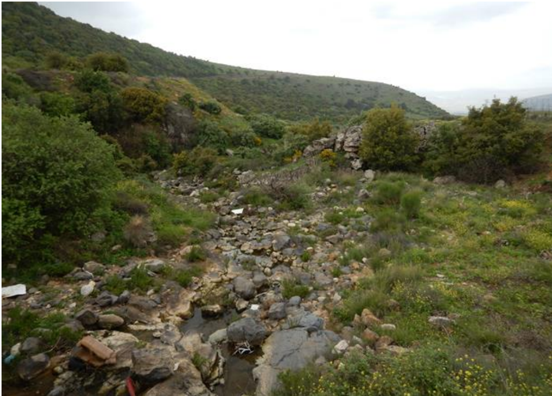
Intermittent stream (Saar - Ein Kinya)