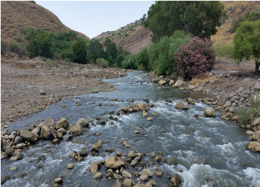
Jordan (Ha'Dodot Bridge)