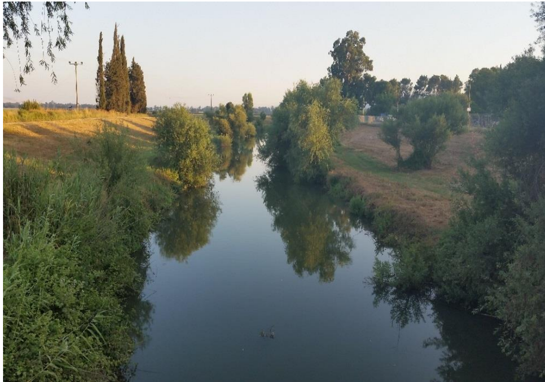
Jordan (Kfar Blum)