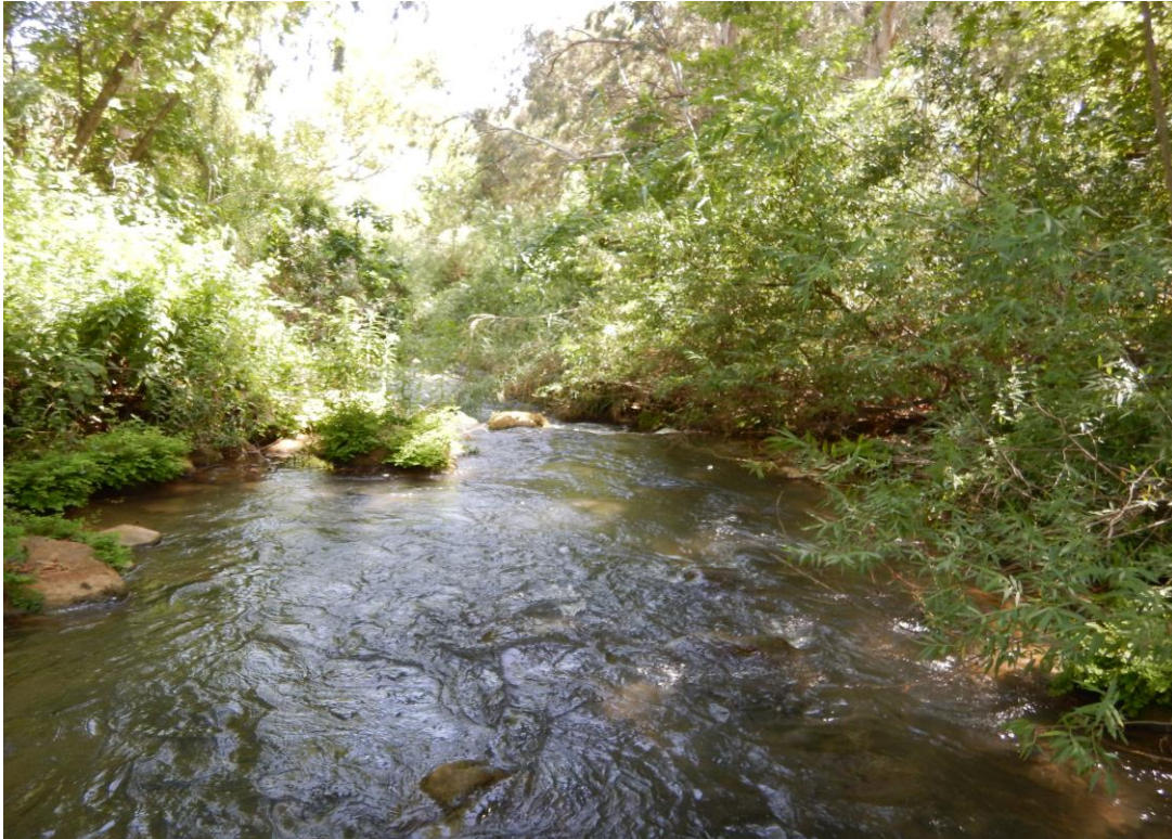
Snir (Nature Reserve)