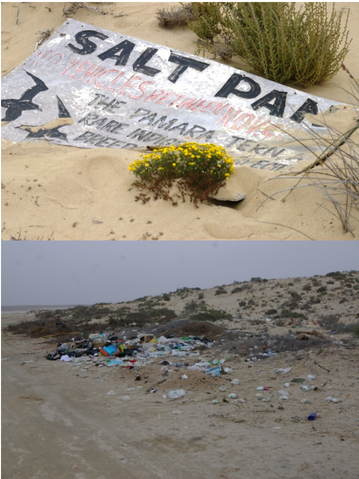
Figure S1: Photographs taken in 2011 of Port Nolloth Pan showing the derelict Damara Tern sign prohibiting vehicular access (top) and the use of the pan's perimeter as a waste dump (bottom)

Ostrich 2018. https://doi.org/10.2989/00306525.2018.1480068