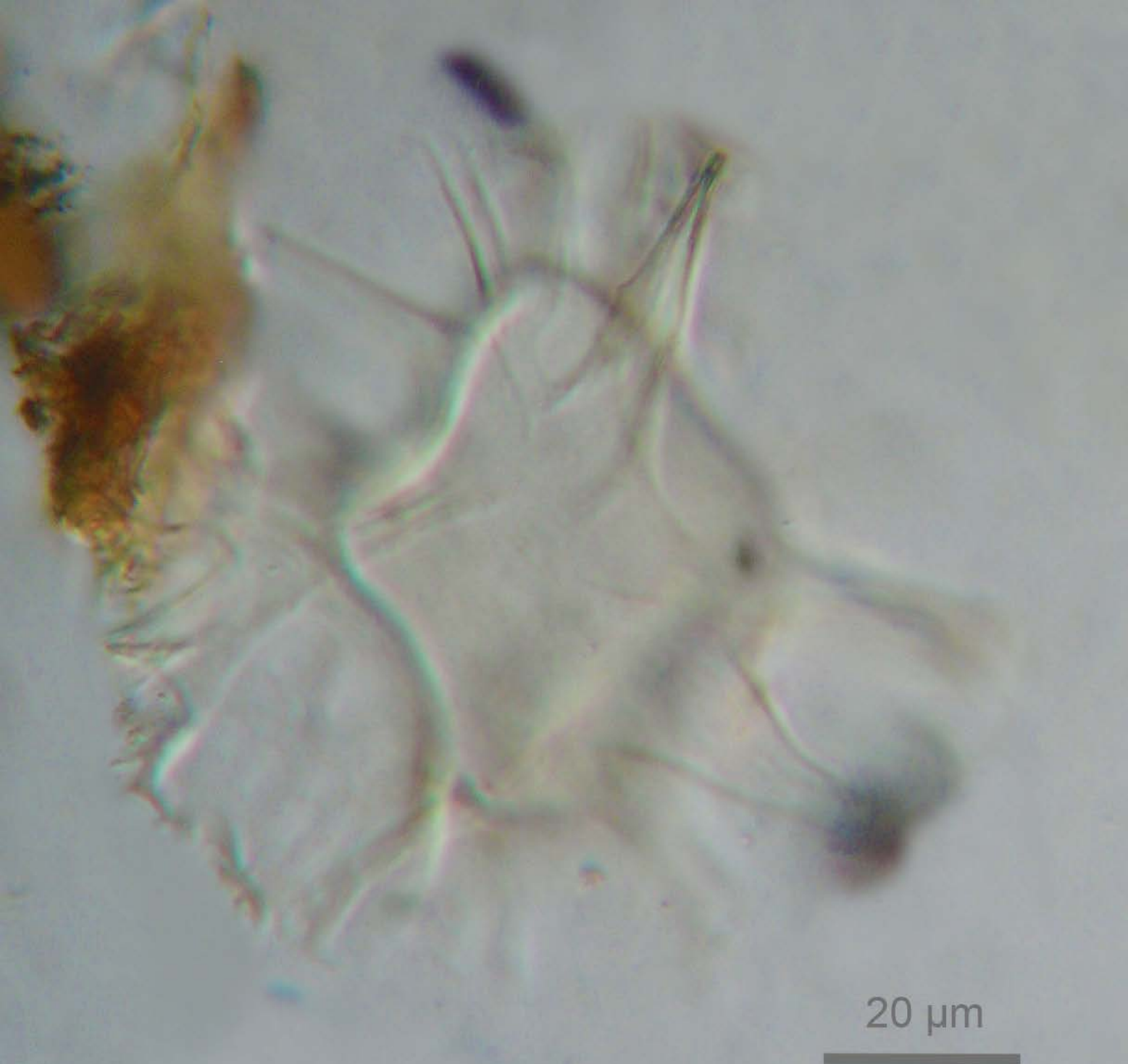
Spiniferites cruciformis Wall & Dale 1973 : Marmara Sea