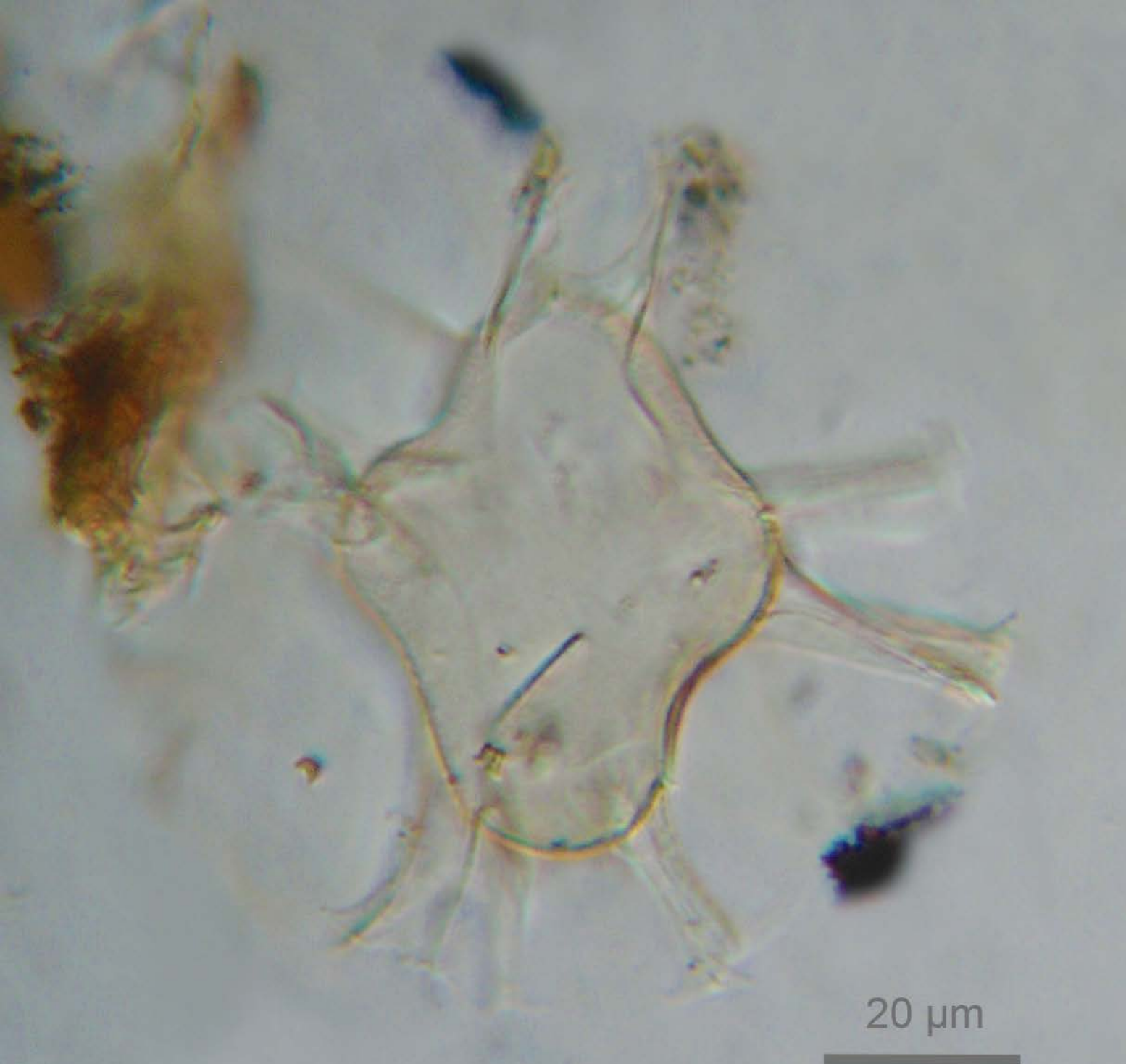
Spiniferites cruciformis Wall & Dale 1973 : Marmara Sea