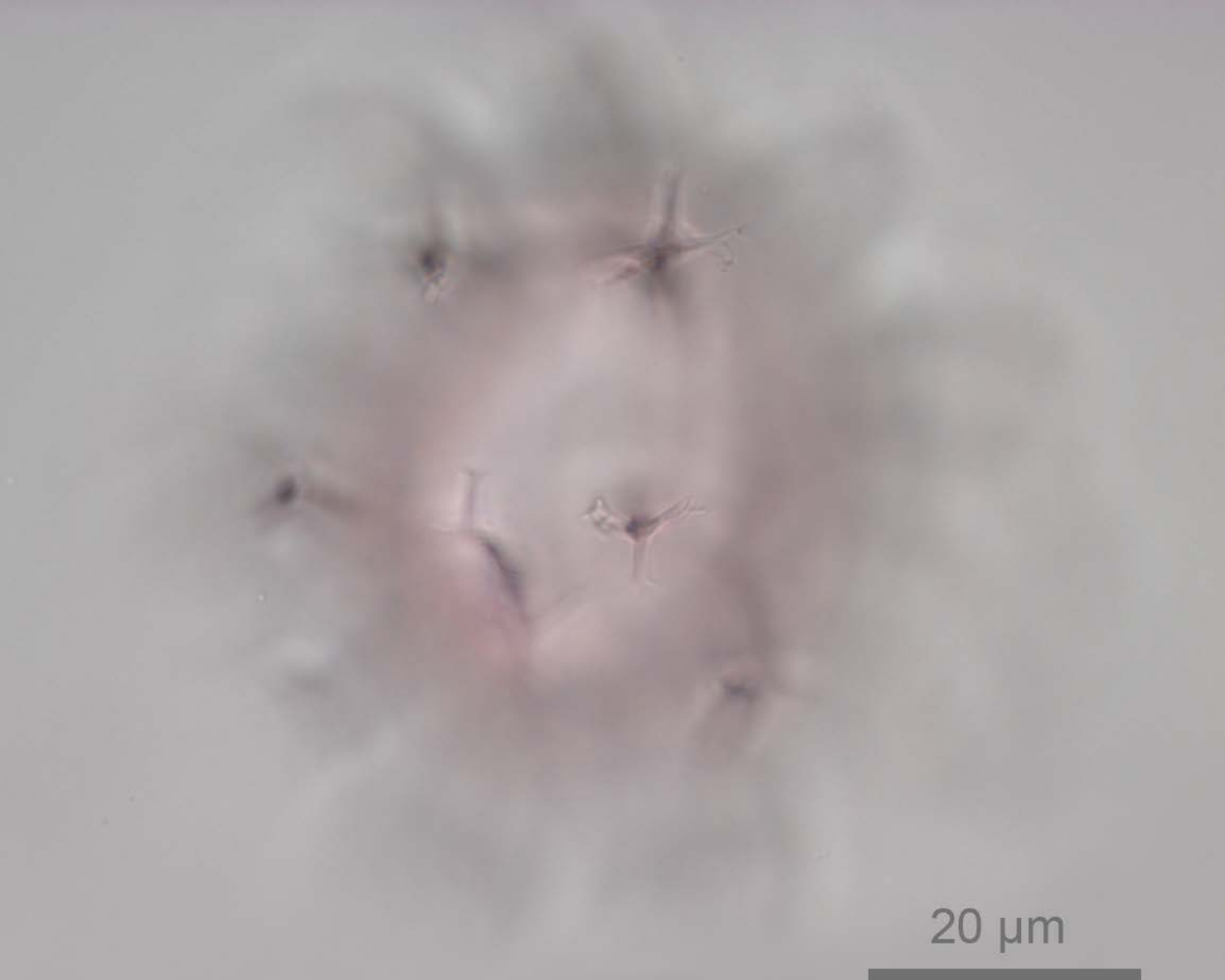
Spiniferites rhizophorus Head in Head et Westphal, 1999 : holotype