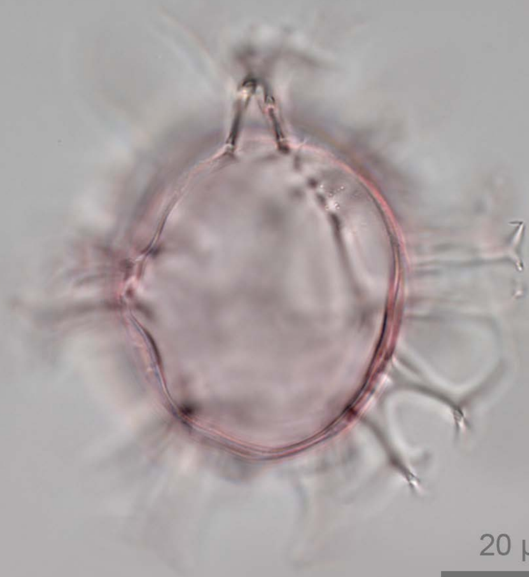
Spiniferites rhizophorus Head in Head et Westphal, 1999 : holotype