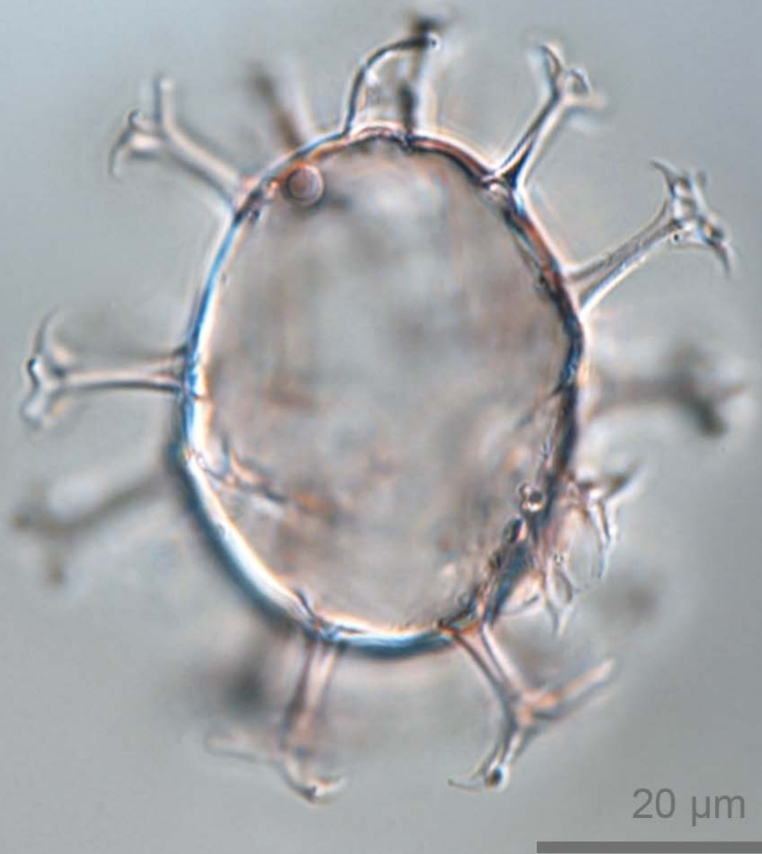
Spiniferites septentrionalis Harland 1977 holotype