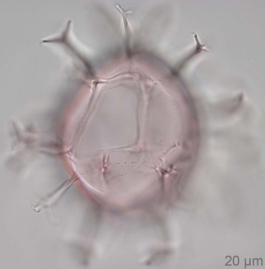
Spiniferites rhizophorus Head in Head et Westphal, 1999 : holotype