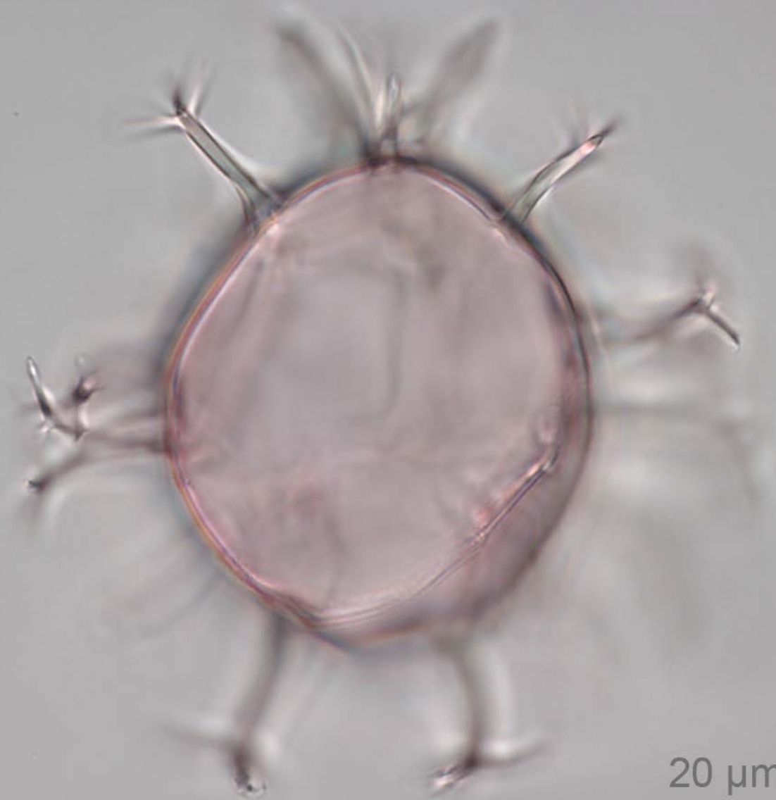
Spiniferites rhizophorus Head in Head et Westphal, 1999 : holotype