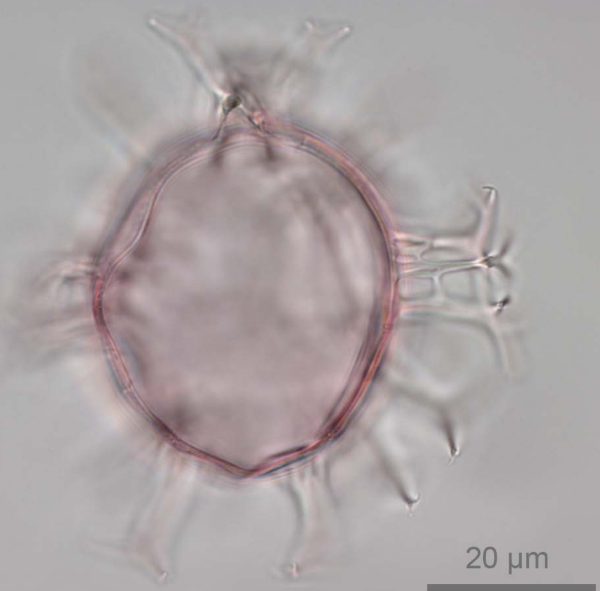
Spiniferites rhizophorus Head in Head et Westphal, 1999 : holotype