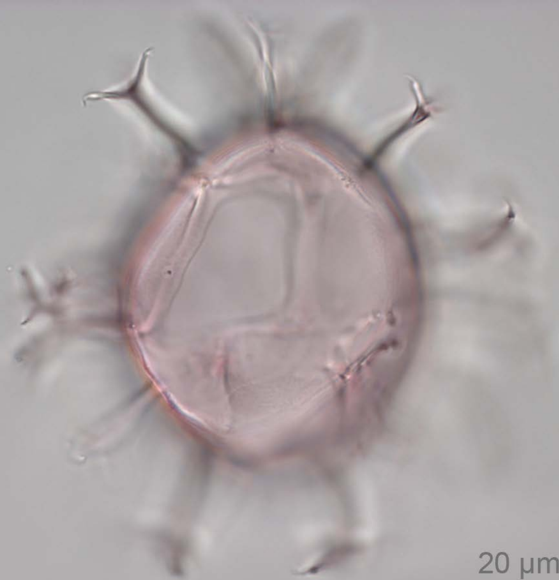
Spiniferites rhizophorus Head in Head et Westphal, 1999 : holotype