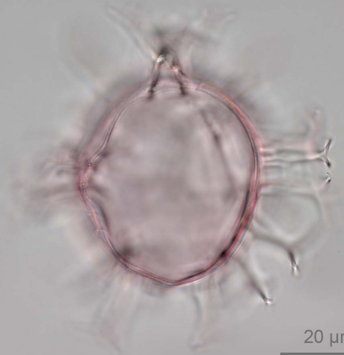
Spiniferites rhizophorus Head in Head et Westphal, 1999 : holotype