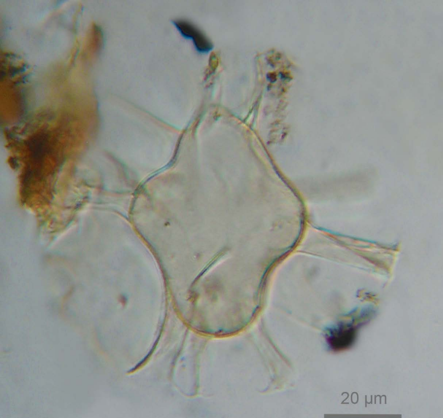
Spiniferites cruciformis Wall & Dale 1973 : Marmara Sea