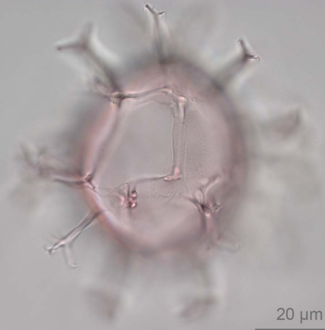
Spiniferites rhizophorus Head in Head et Westphal, 1999 : holotype