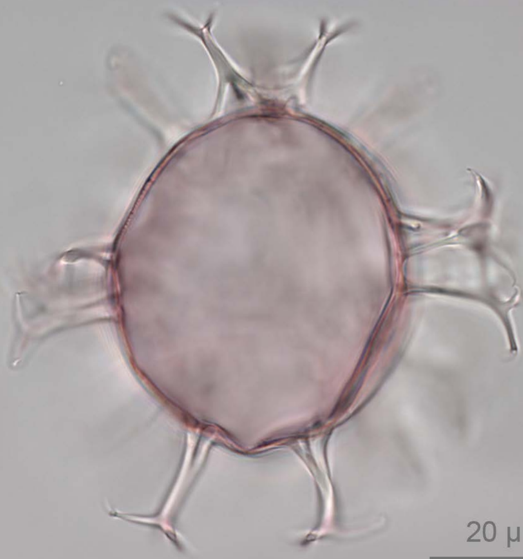
Spiniferites rhizophorus Head in Head et Westphal, 1999 : holotype