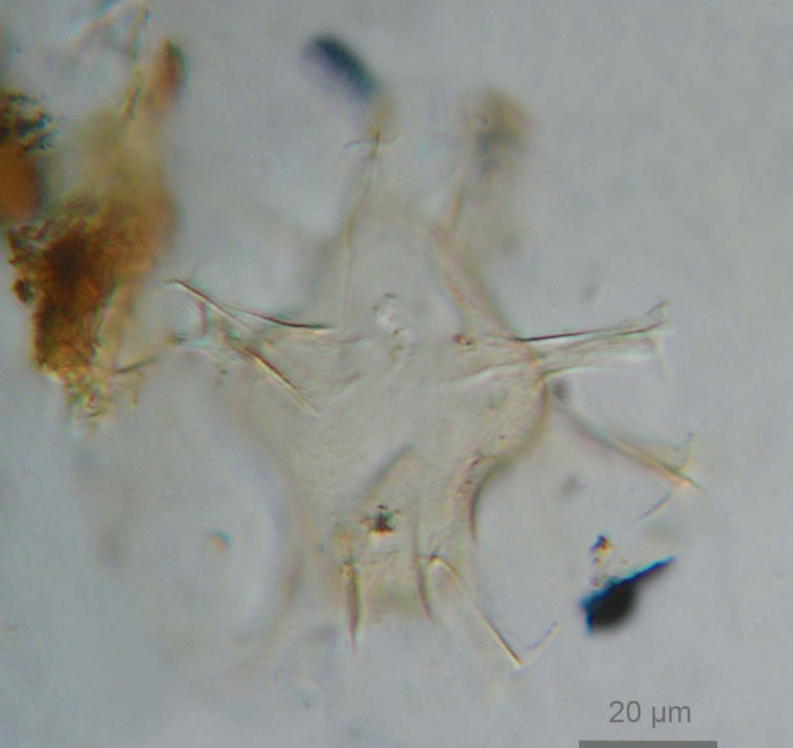
Spiniferites cruciformis Wall & Dale 1973 : Marmara Sea