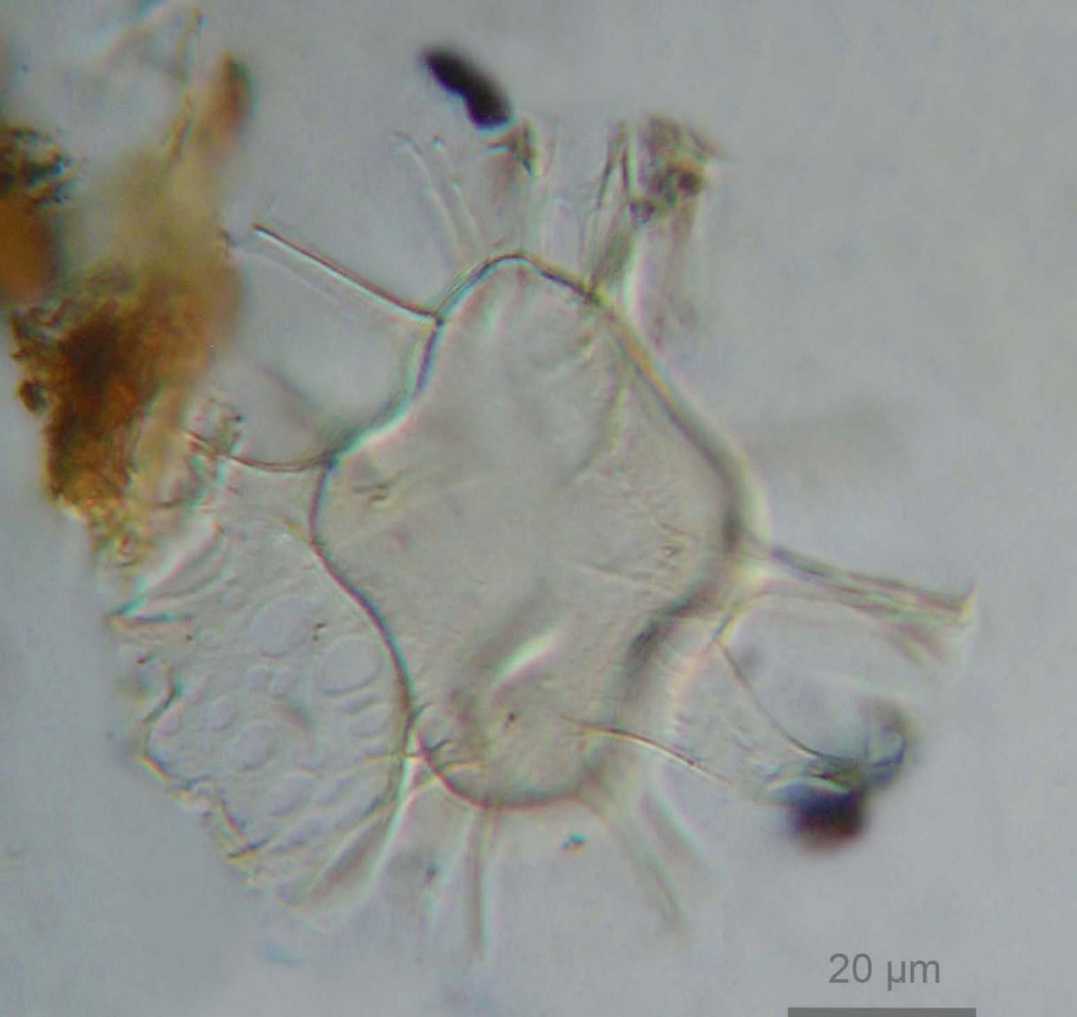
Spiniferites cruciformis Wall & Dale 1973 : Marmara Sea