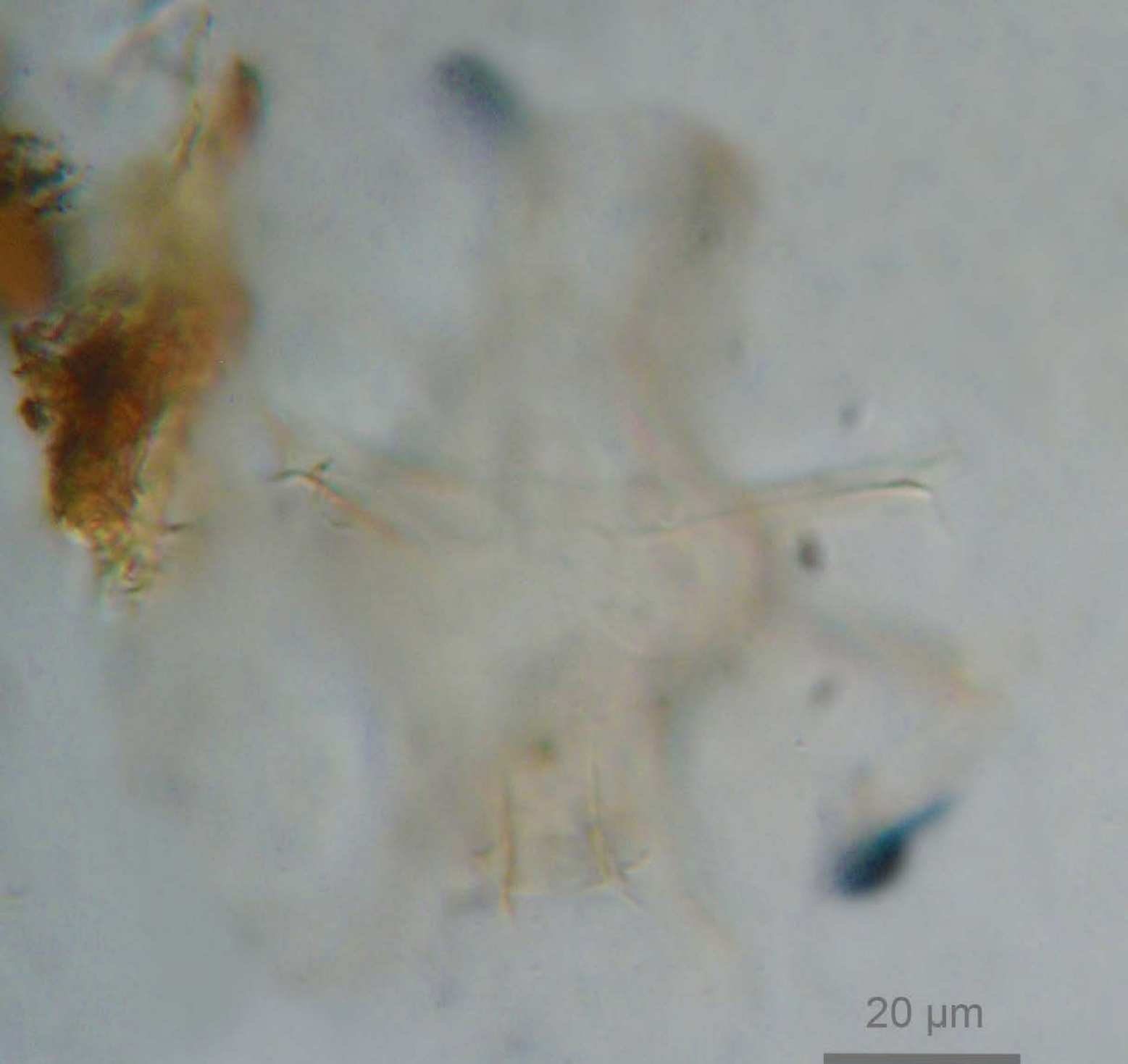
Spiniferites cruciformis Wall & Dale 1973 : Marmara Sea