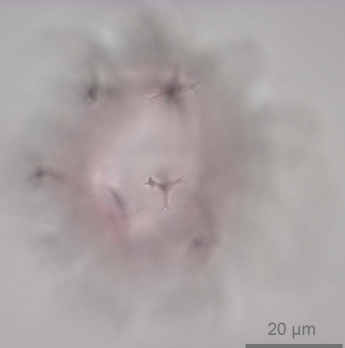
Spiniferites rhizophorus Head in Head et Westphal, 1999 : holotype