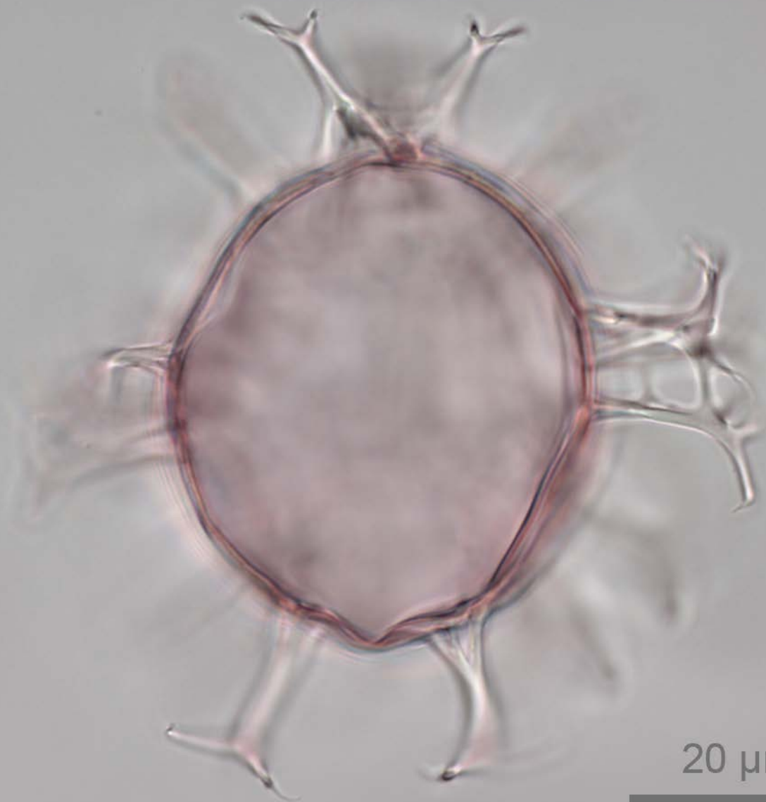
Spiniferites rhizophorus Head in Head et Westphal, 1999 : holotype