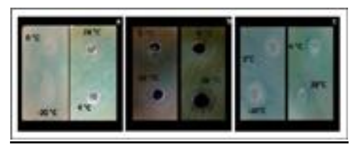
Figure S2. Qualitative screening images indicating QSI activity of NP formulation kept at different temperature conditions (a) after 2 months (b) after 4 months (c) after 8 months using E. coli MG4 reporter strain.