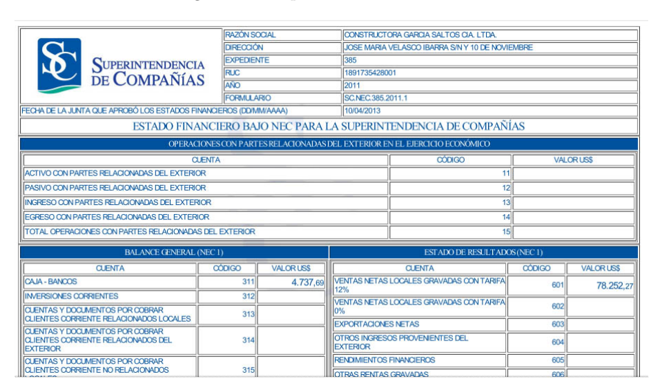
Figure 2: Sample financial information

The figure above presents a financial return available as a structured format. The data from this balance was extracted using an automated script.